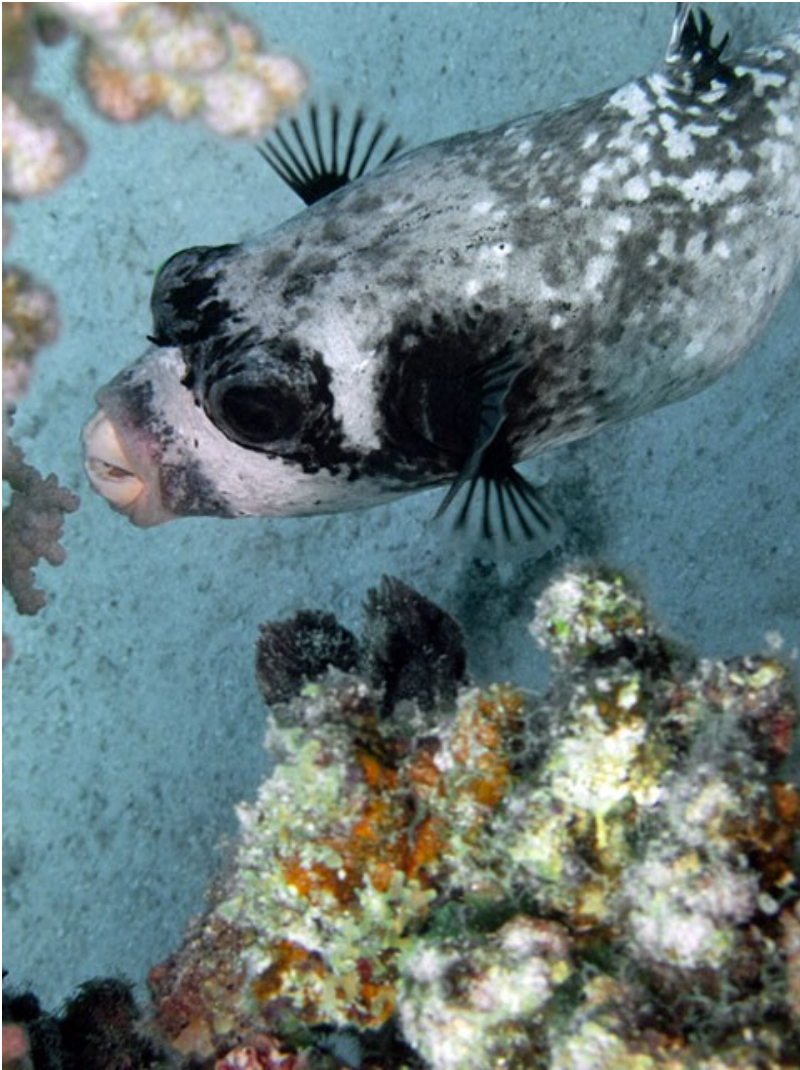
Masked pufferfish taken in Hamata, Red Sea. You can clearly see the fused teeth.