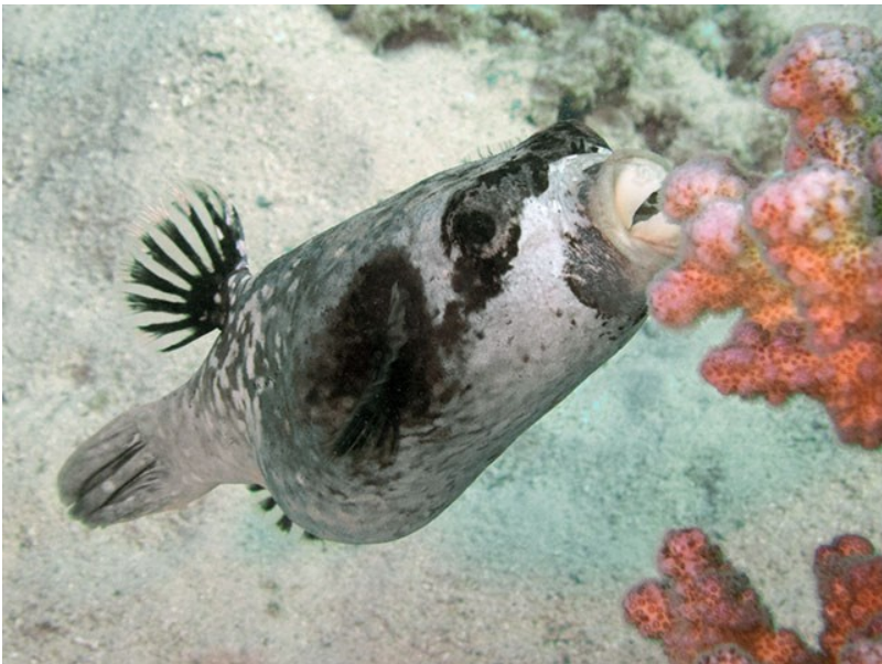
Masked pufferfish.

The Puffer is harmless, unless eaten. The liver, intestines, gonads and skin are highly poisonous and cause death in around 60% of people who eat it . If prepared properly the puffer (or fugu) is edible and considered a delicacy in Japan and Korea.