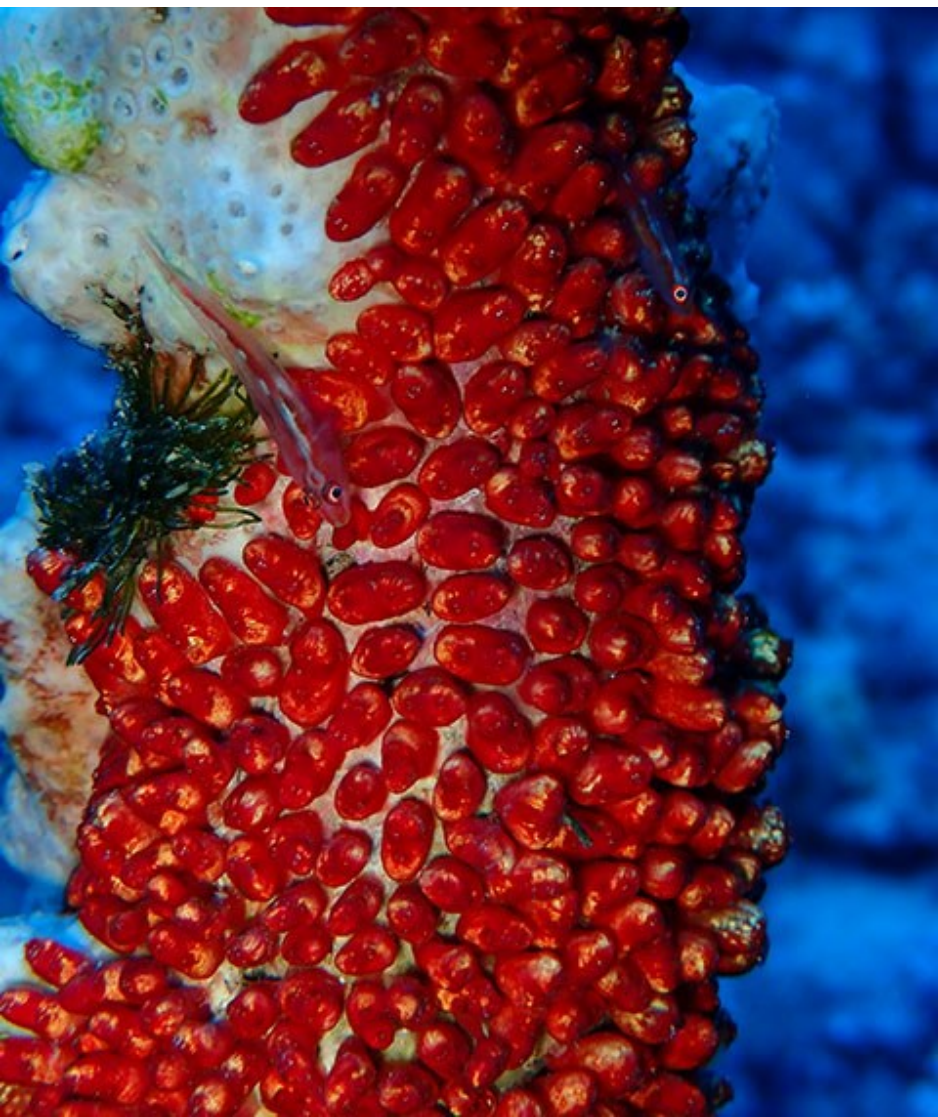
Cherry synascidia on a small column of coral. Together with two tiny gobies.

This cherry tunicate is colonial. The members of the colony, the zooids, are 4-5 mm across and linked by fine strands of tunic.