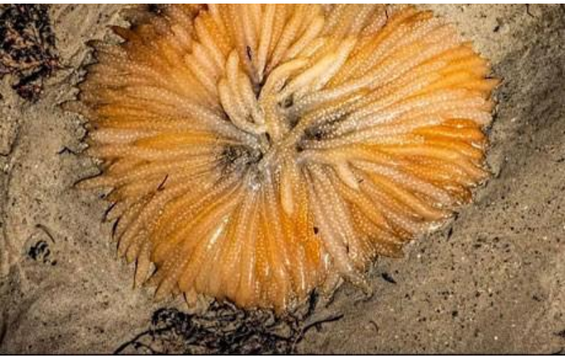
Mass of squid egg capsules. The white "dots" are the eggs, surrounded by a yellow jelly-like covering.