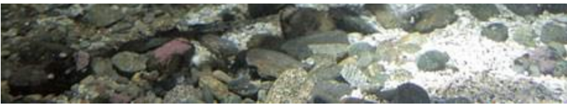
European or Common Squid Loligo vulgaris . Aquarium Finisterrae de A Coruña CC BY-SA 2.0

Strong swimmers, squid use their fins to swim like fish and their siphon to propel themselves very quickly forwards or backwards.