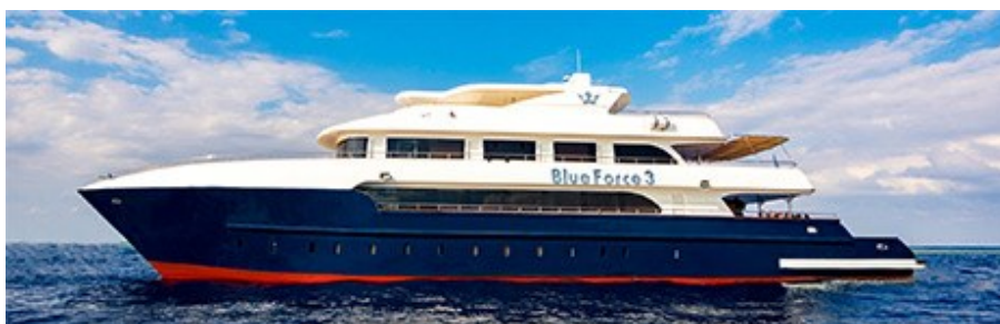
Photo Workshop in the Red Sea