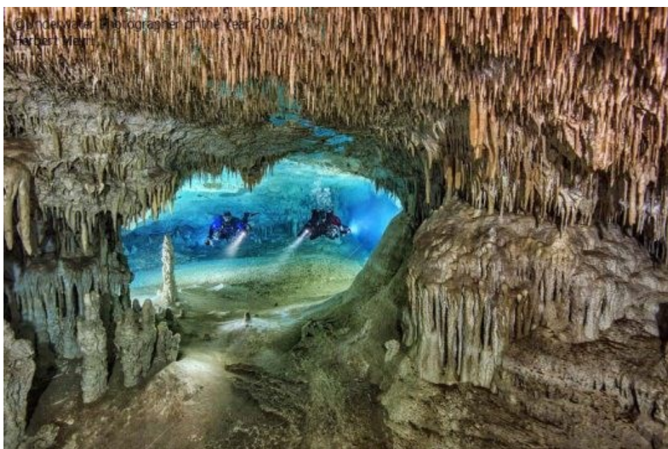
Cenote Nariz