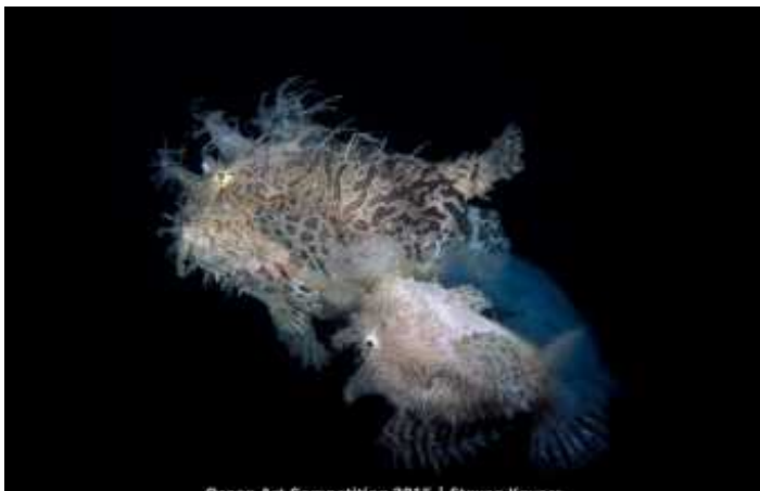
When a female Striated frogfish is ready to spawn she rises towards the surface closely followed by the male. As she releases her egg mass the male fertilizes them.