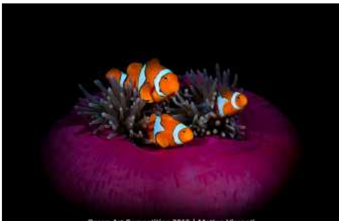
2nd Place Wide-Angle by Matteo Visconti, Fathers Reef, Kimbe Bay, Papua New Guinea

Martin Edge, judge and author of The Underwater Photographer , adds “There were too many cluttered backgrounds in the 1st round. You have to pay attention to what is behind your main subject and in particular, try to avoid elements which merge into each other.” He continues “Aspect ratio! You are allowed to crop your image before you enter the competition, but I felt that too many from the 1st round were leaving too much empty space around your subject.”