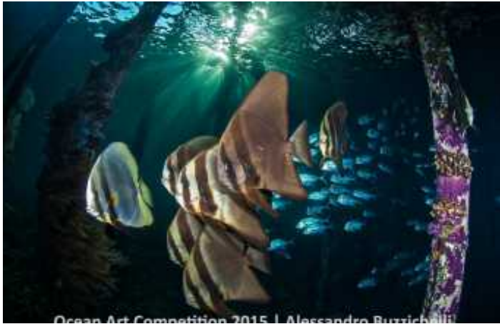
Taken on the island of Wai (Raja Ampat) by Alessandro Buzzichelli. Batfish and jackfish 4th Place Wide-Angle

Martin Edge, judge and author of The Underwater Photographer , adds “There were too many cluttered backgrounds in the 1st round. You have to pay attention to what is behind your main subject and in particular, try to avoid elements which merge into each other.” He continues “Aspect ratio! You are allowed to crop your image before you enter the competition, but I felt that too many from the 1st round were leaving too much empty space around your subject.”