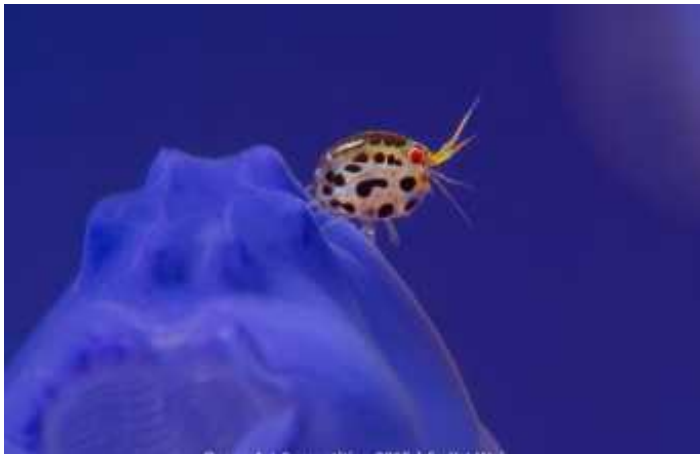
Taken on Tulamben, Bali by So Yat Wai. The purple background is a tunicate.

Thousands of entries were viewed by the judges before the final set of images were selected.