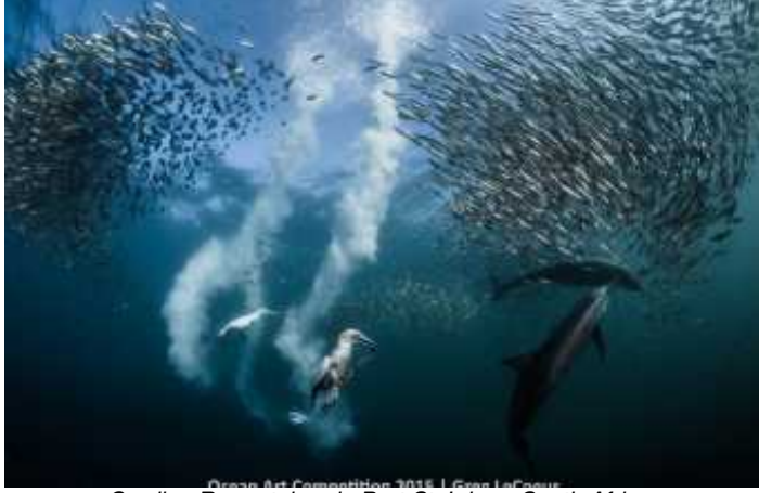
Sardine Run – taken in Port St Johns, South Africa. Cape Gannet taking advantage of the strategy of the dolphins